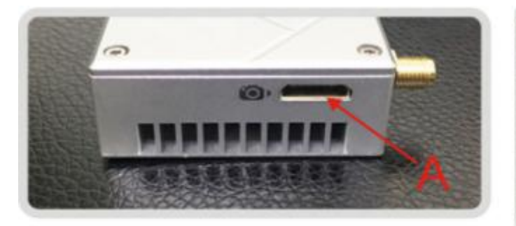
A: 1* Mini HDMI Port on TX & RX