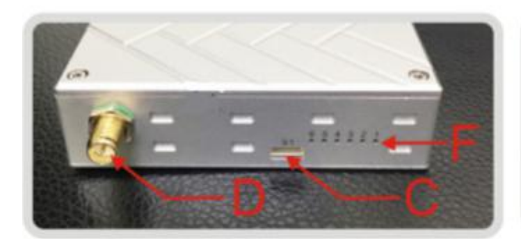
C: 1*TTL Bidirectional Serial Port D:1*SMA Antenna Port F: Working State Indicator